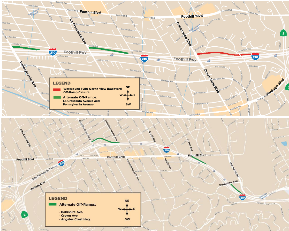
Westbound I-210 Ocean View Avenue Full Off-ramp Closure Map