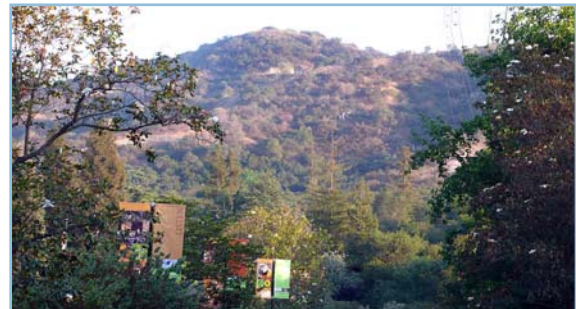
Open space south of Descanso Gardens

The Open Space and Recreation Element summarizes existing conditions regarding open space, parks and recreation facilities, and trails; describes guidelines for the preparation of an integrated parkland system; discusses implications and considerations for future parkland planning; and includes associated goals, objectives, and policies.