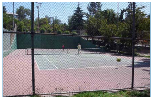
Tennis court at Glenhaven Park

Public agencies responsible for identifying goals and developing plans for park, recreation, and open space facilities often refer to the Park, Recreation, Open Space, and Greenway Guidelines (Guidelines) that were developed by the National Recreation and Park Association (NRPA). NRPA is an independent, non-profit organization, and is the primary professional organization in the field. The original 1983 Guidelines, which were updated in 1990, recommended that a park system should be composed of a “core” system of parklands with a total of 6.25 to 10 acres of developed open space per 1,000 residents (National Recreation and Park Association 1990). When NRPA revised those standards in 1996, it acknowledged that every community has its own unique blend of social, economic, institutional, and natural resource characteristics that influence the most appropriate quantity, quality, and mix of park, open space, and recreational facilities within the jurisdiction’s fiscal limits. It also recognized that that the long-standing recommended national standard of 10 acres per 1,000 persons is not necessarily