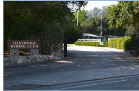
Flintridge Riding Club

Organized recreation is also offered through non-City organizations, such as the Community Center of La Cañada Flintridge and the Crescenta-Cañada YMCA. Private recreational facilities include the Flintridge Riding Club, the La Cañada Flintridge Country Club, and the Flint Canyon Tennis Club. Figure OSRE-1 shows the location of City-owned, joint-use, and major non-profit and private recreation facilities within the City, and the current trail system.