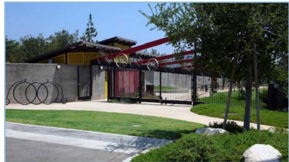
Mayors' Discovery Park

land in the City is very high. The plan also should acknowledge the community's vision and goals, such as the desire to retain the City's low density, single-family character and the value citizens place on the equestrian nature of the community. Demographic considerations should include the fact that the population is aging and the number of families with young children is declining and projected to continue to do so within the foreseeable future. (See Chapter 9, Housing Element , for relevant demographic data.) Figure OSRE-1 illustrates how the existing parkland spaces are linked currently.